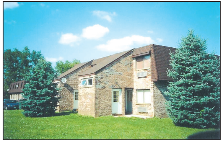
Northtown Apartments, Holland