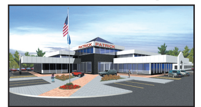
Rendering of the Patrick Pontiac, GMC, and Jeep dealership.